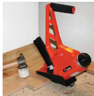
3/4" Hardwood flooring