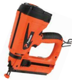
IMLI200 – 18 GAUGE FINISH NAILER