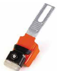
Part No. 901252 Cordless No mar tip