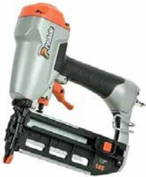
T250S F16P – 16 GAUGE FINISH NAILER