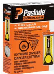
Part No. 650039 Universal Trim Fuel Cell (4 Pk)