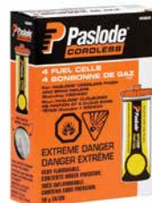
Part No. 650039 Universal Trim Fuel Cell (4 Pk)