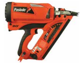
CORDLESS IMPULSE XP FRAMING NAILER