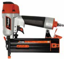
P18-200 – 18 GAUGE BRAD NAILER