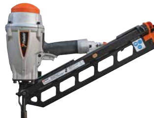
POWERMASTER PLUS 4" FRAMER