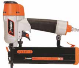
P18-FS200 – 18 GAUGE BRAD NAILER/STAPLER