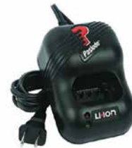
Part No. 902667C Lithium Battery Charger