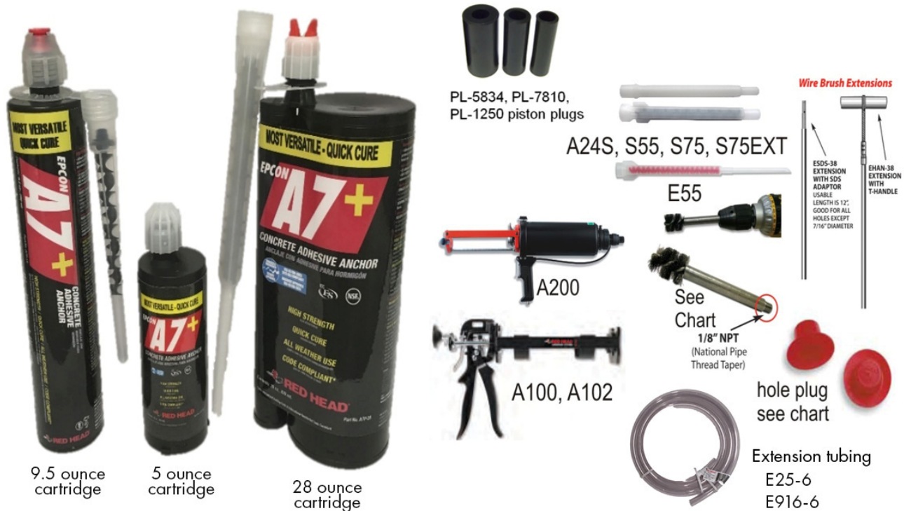
FIGURE 1—RED HEAD EPCON A7+ ADHESIVE CARTRIDGES, DISPENSING TOOLS, MIXING NOZZLES, HOLE CLEANING BRUSHES AND HOLE PLUGS

Red Head A7+ Adhesive is identified by labels on the adhesive cartridges bearing the adhesive manufacturer's name (ITW Commercial Construction North America) and address (Glendale Heights, Illinois), the product name (Red Head A7+), best-used-by expiration date, and the evaluation report number (ESR-3903).