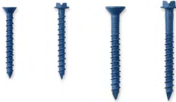
FIGURE 1—TAPCON® SCREW ANCHOR WITH ADVANCED THREADFORM TECHNOLOGY