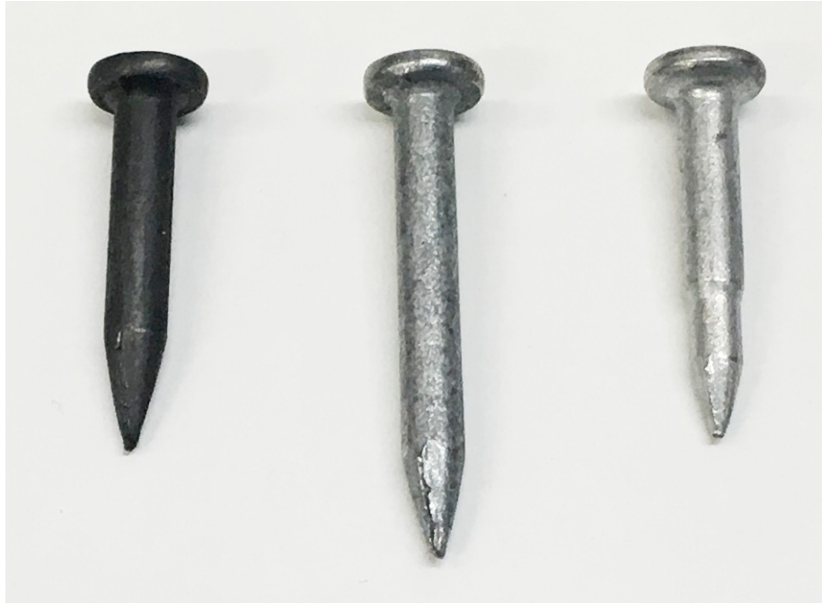
From left to right: T3034B, T3100 and T3034S.

3 For steel-to-steel connections designed in accordance with Section 4.1.4, the tabulated allowable load may be increased by a factor of 1.25, and the design strength may be taken as the tabulated allowable load multiplied by a factor of 2.0.